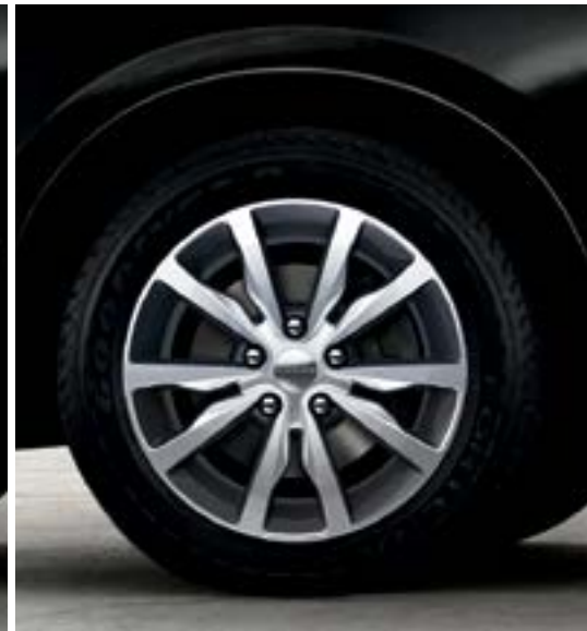
18-inch polished aluminum with Mineral Gray pockets (standard on Limited)