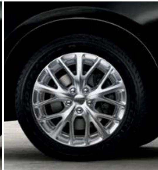
20-inch polished aluminum (standard on Citadel)